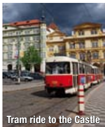
Tram ride to the Castle

After a typical Czech lunch served in a nice restaurant we take our cruise. Prague Castle crowning the top of a picturesque hill, the Lesser Town, the Church of St. Nicholas - a jewel of the Baroque, Charles Bridge - the oldest one in Prague, the National Theatre... Get unsurpassed views of all Prague's treasures from the river! After the cruise we come to the Castle, the real heart of Prague. Your guide takes you through all the courtyards, shows you the Old Royal Palace, the Basilica of St. George, the Royal Garden, the Golden Lane... and the architectural gem of St. Vitus Cathedral. On this tour with a great guide, you can peer into the past from the 21st century.