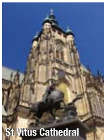
St Vitus Cathedral

We admire the rich history of the Old Town with the marvellous Church of St. James, the medieval customs yard Ungelt, the Estates Theatre where Mozart's Don Giovanni was introduced to the world, and the Charles University, the oldest one in Central Europe. On Wenceslas Square we see where the Velvet Revolution occurred in 1989.