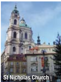
St Nicholas Church